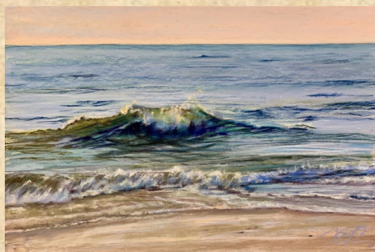
Morning Has Broken, 12x18