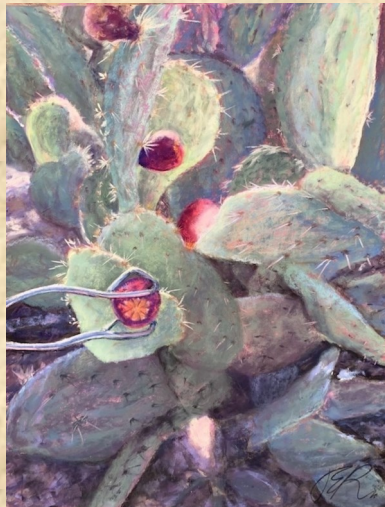
Picking Prickly Pear, 18x24