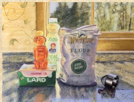
Biscuits Today, 27x36