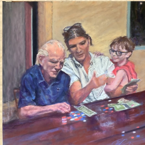
Poker Paternity, 20x20