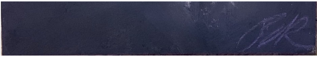
"Blowin' In the Wind"