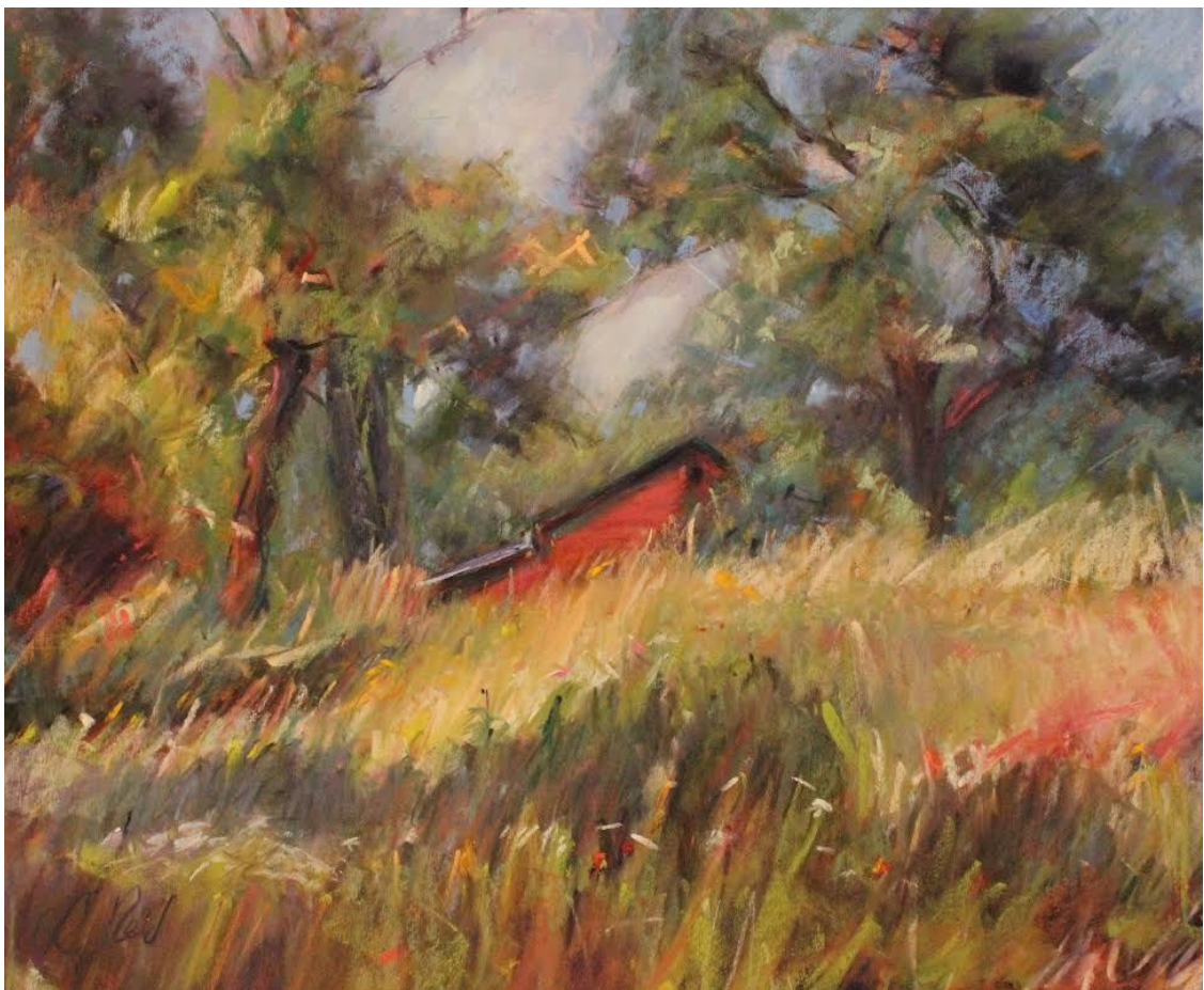
"Before the Cut"