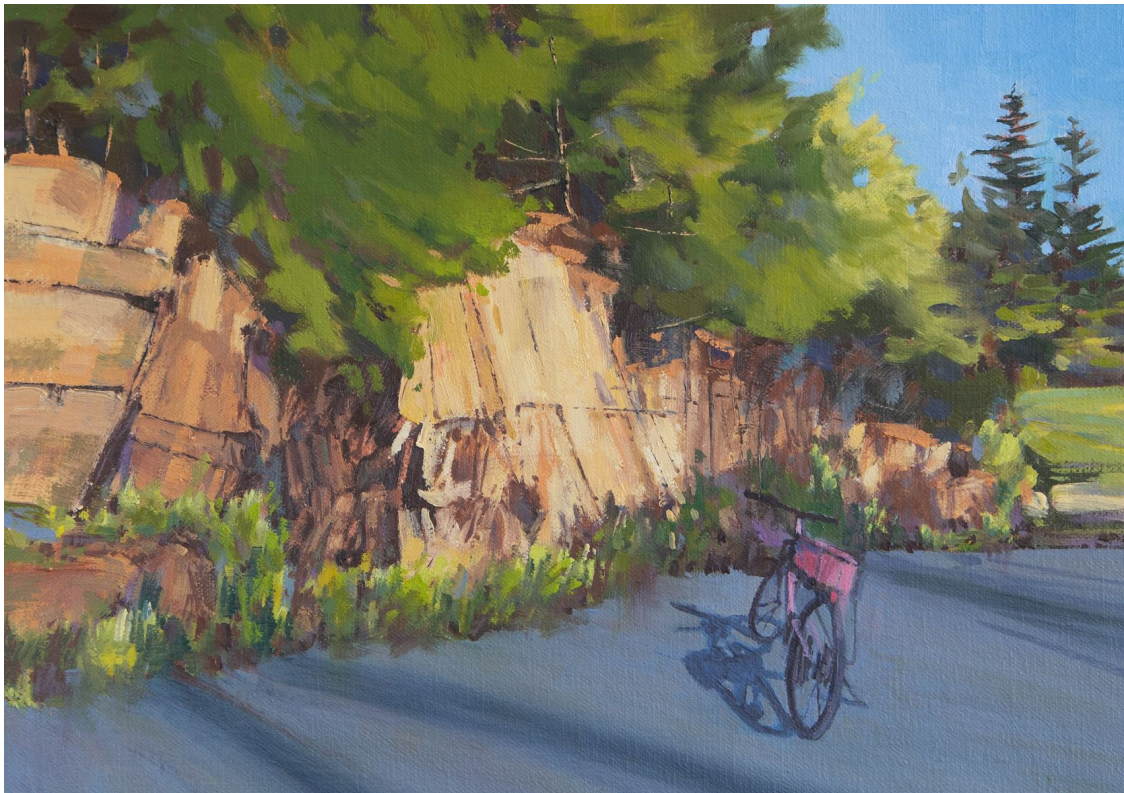
"Biking Acadia National Park"