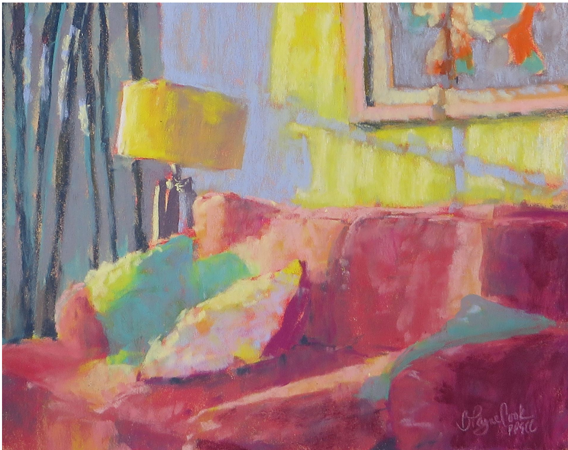
"Time To Relax"