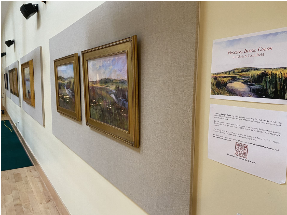
Proctor Academy Gallery Exhibit