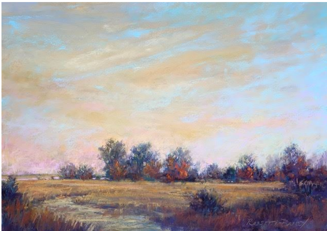
" Autumn Reverie "

" Down the Road " and " Autumn Reverie " were accepted into South Shore Art Center - "On Common Ground" , Cohasset, MA, January 12-February 18, 2023.