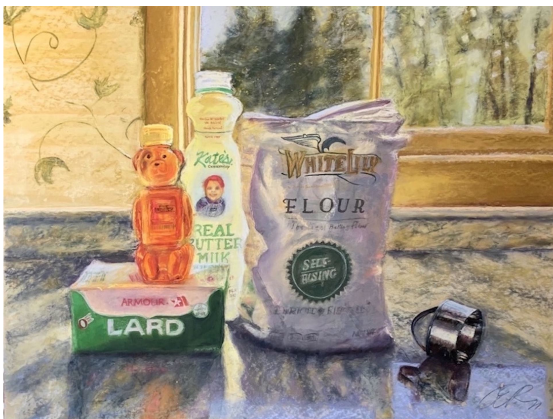
" Biscuits Today "