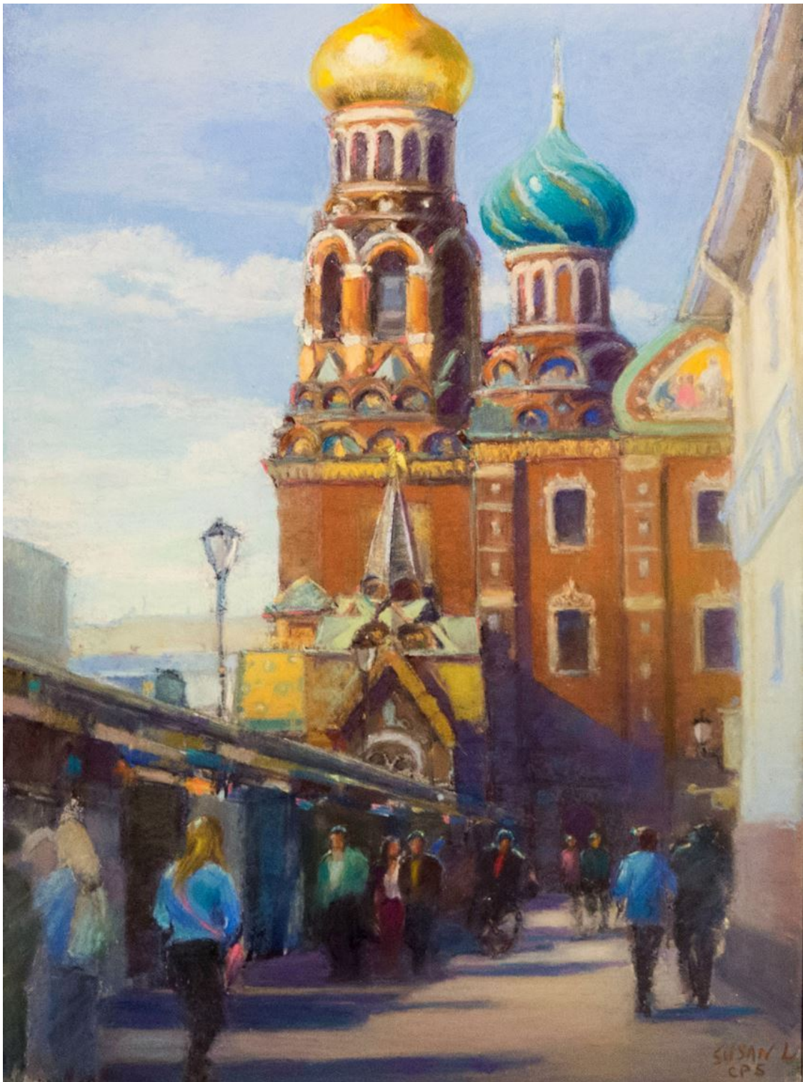
"A Day at Saint Petersburg"