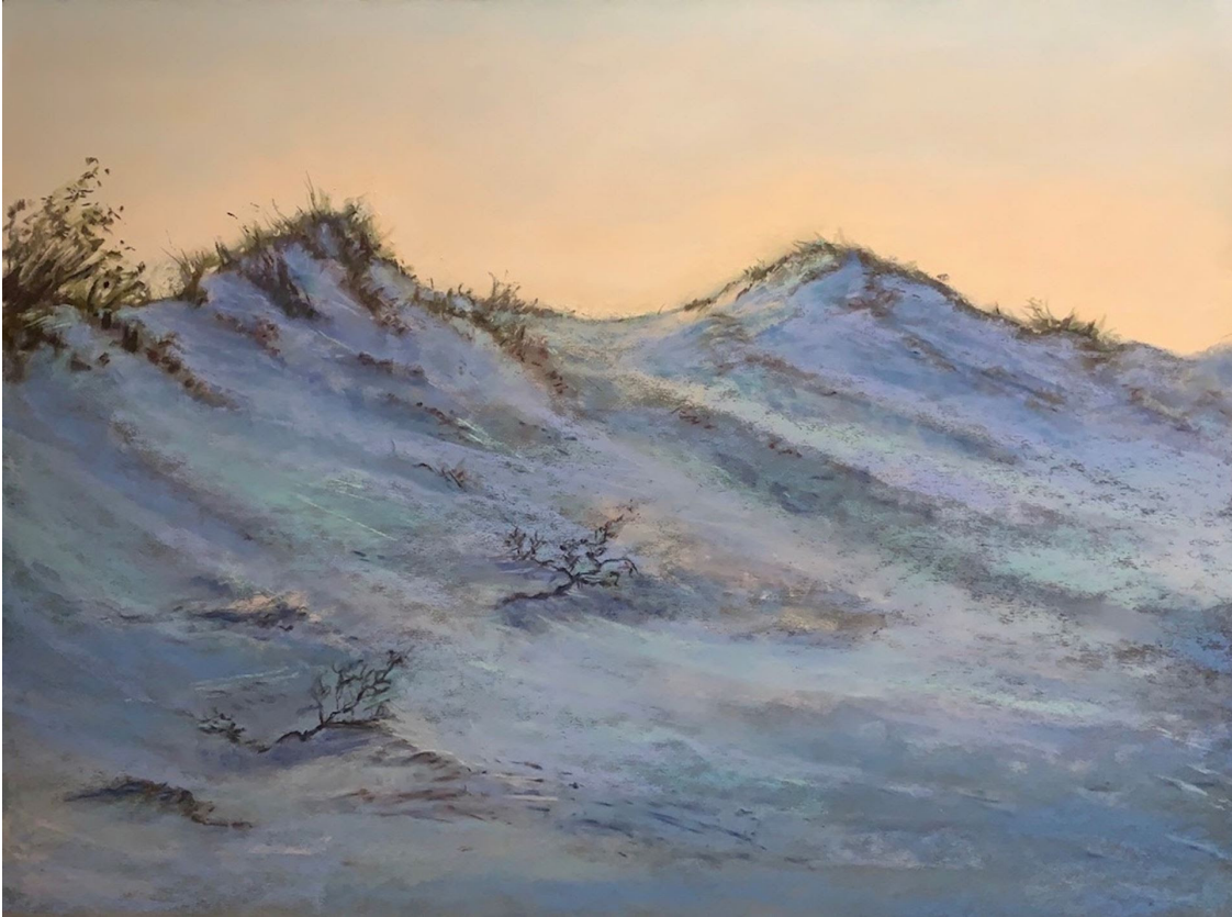
Dark Side of the Dune, 18x24